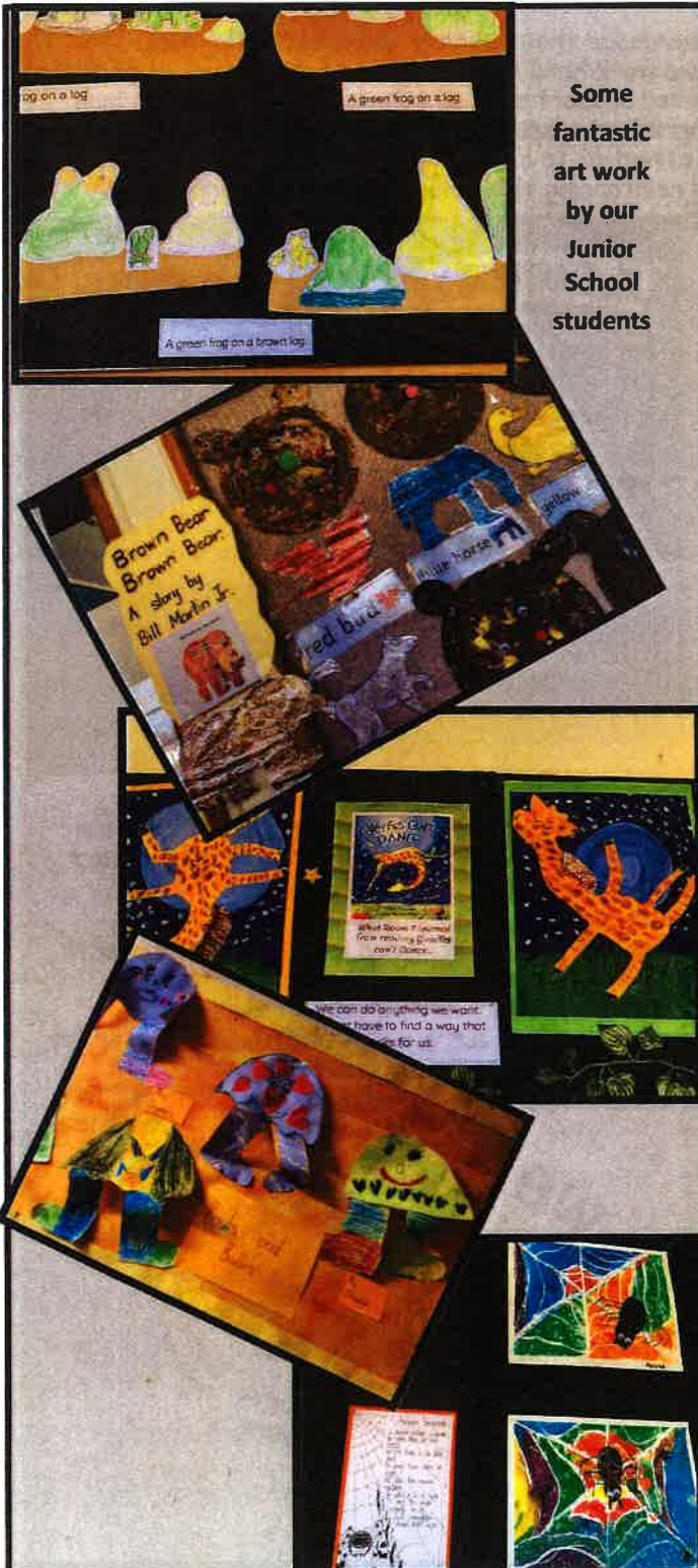
Some fantastic art work by our Junior School students